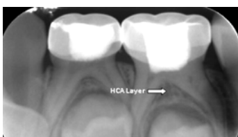
Figure 5. 12-month follow-up periapical radiograph showing radiopacity in 2 nd molar