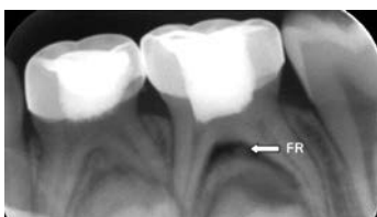
Figure 4. 6-month follow-up periapical radiograph suggesting of furcal radiolucency (FR) in 2 nd molar