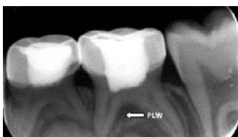
Figure 3. 3-month follow-up periapical radiograph suggesting widening of periodontal ligament (PLW) in 2 nd molar