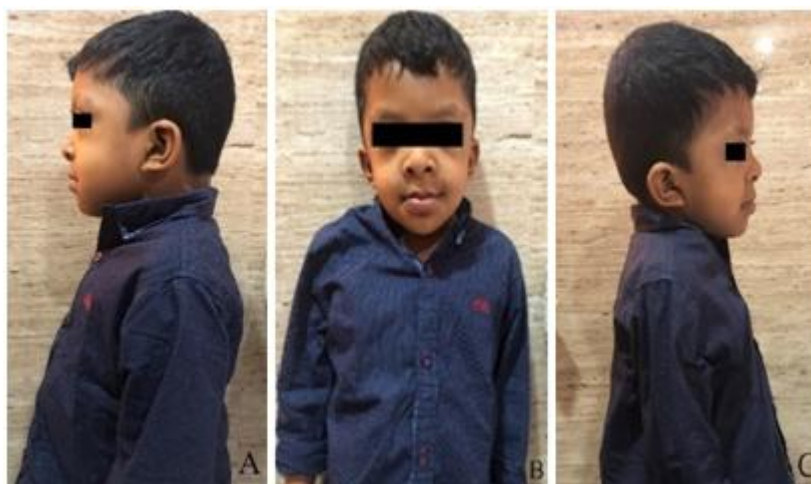
Figure 2. Profile image. A: Left lateral view; B: Frontal view; C: Right lateral view

On intraoral examination, mixed dentition with poor oral hygiene and multiple carious teeth were evident with a history of restoration done from a private clinic in relation to a mandibular posterior tooth. The child's mother reported to have brushed his teeth once daily with no other hygiene aids used. With respect to soft tissue examination, there were no abnormalities of mucosa, floor of mouth and tongue. Clinically, the U-shaped maxillary arch revealed a depression in the mid palatal area with no history of cleft palate repair, suggestive of developmental deformity in the fusion of the palatal shelves. Mandibular arch was U-shaped with class III malocclusion and cross bite in relation to 53 and 63. Generalized deep carious lesions and root stumps were noticed (Figure 3A, B). An Orthopantomogram revealed normal dental age and development. Condyles appeared to be normal, with no signs of ankylosis (Figure 3C).