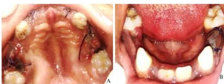
Figure 4. Post operative photographs. A: Maxillary occlusal view; B: Mandibular occlusal view

Van der Burg et al. 10 developed a scoring system where presence of one major/ two minor and two major/ one minor sign is required for the diagnosis of Noonan syndrome (Table 2).